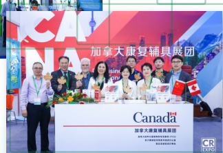
▲ Canada Pavilion