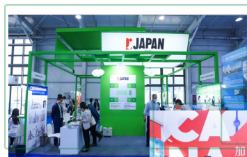
▲ Japan Pavilion

Brands from the United States, Canada, Germany, Japan, France, Denmark, Sweden, Switzerland, Belgium, Singapore, and beyond.